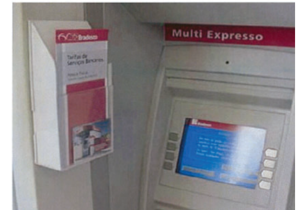
Looks like a normal brochure holder — notice how thick the holder is — this is to allow the video camera to hide inside