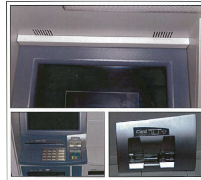
Skimming typically involves the use of hidden cameras (top) to record customers' PINs and phony keypads (right) placed over real keypads to record keystrokes.

Their scheme involved installing surreptitious surveillance equipment on New York City ATMs that allowed them to record customers' account information and PINs, create their own bank cards, and steal from customer accounts.