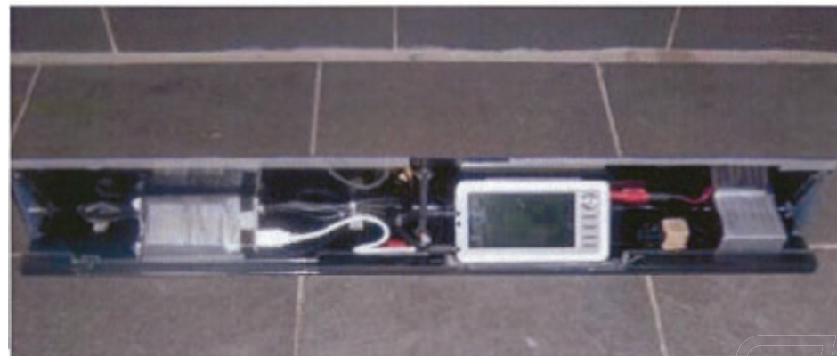
Inside is the video camera which captures your information

In the fall of 2015, two brothers from Bulgaria were charged in U.S. federal court in New York with using stolen bank account information to defraud two banks of more than $1 million.