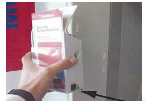
On the interior side of the holder, a hole is cut out to allow the video camera to view your pin number and account number