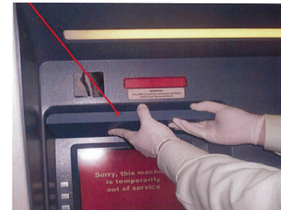
Removal of the fake device from the ATM machine.