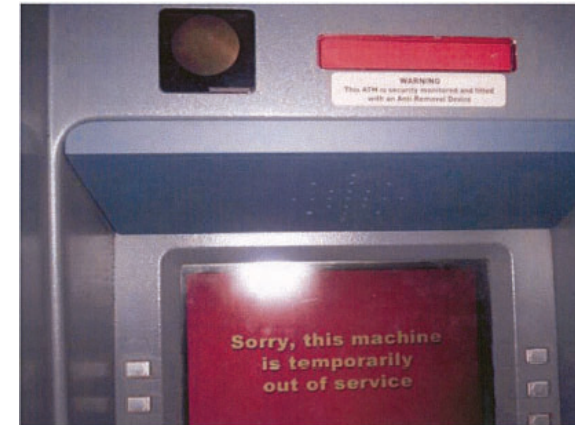
What appears to be a normal speaker above the keypad is actually a hidden camera to read your pin number